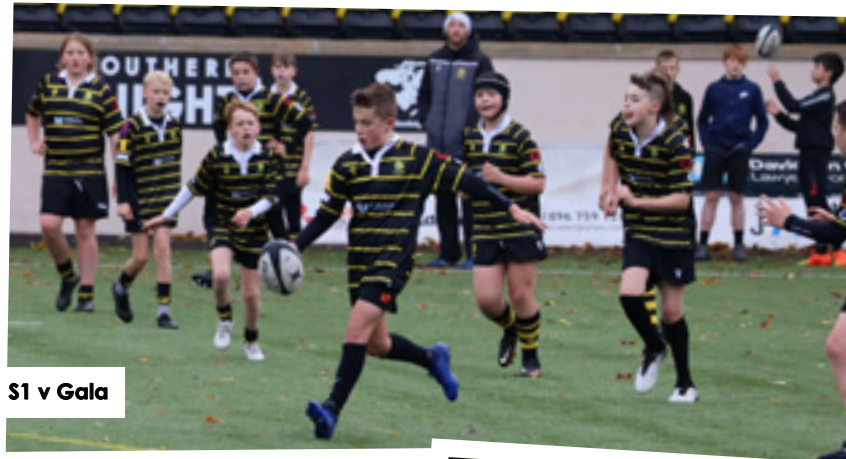
S1 v Gala