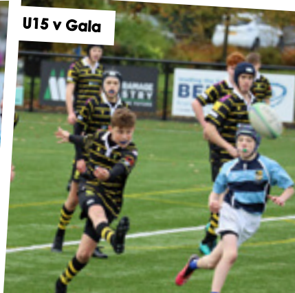
U15 v Gala