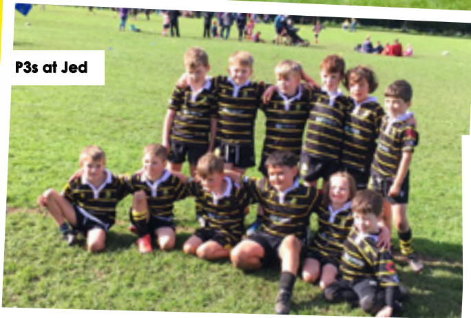
P3s at Jed