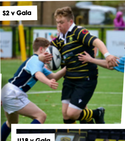
S2 v Gala