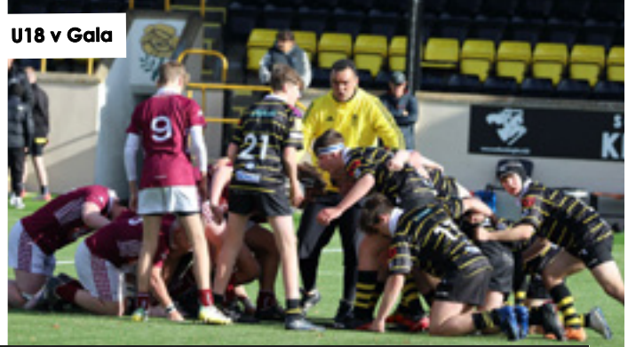
U18 v Gala